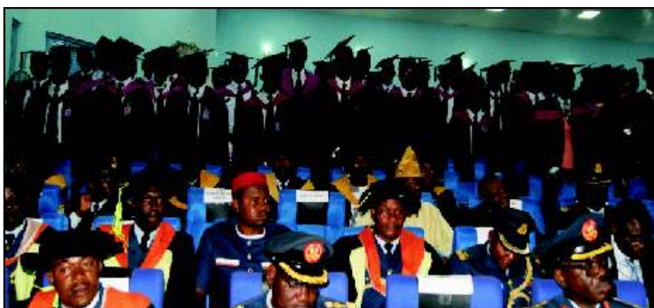
Cross section of guests and graduands at the ceremony