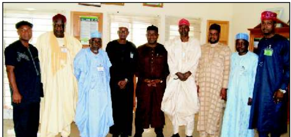
Group photograph of ES NBTE (5th right) and some management staff with TOPREC delegation.

Qualification Framework (NVQF) training to develop skill manpower for the growth of the economy.