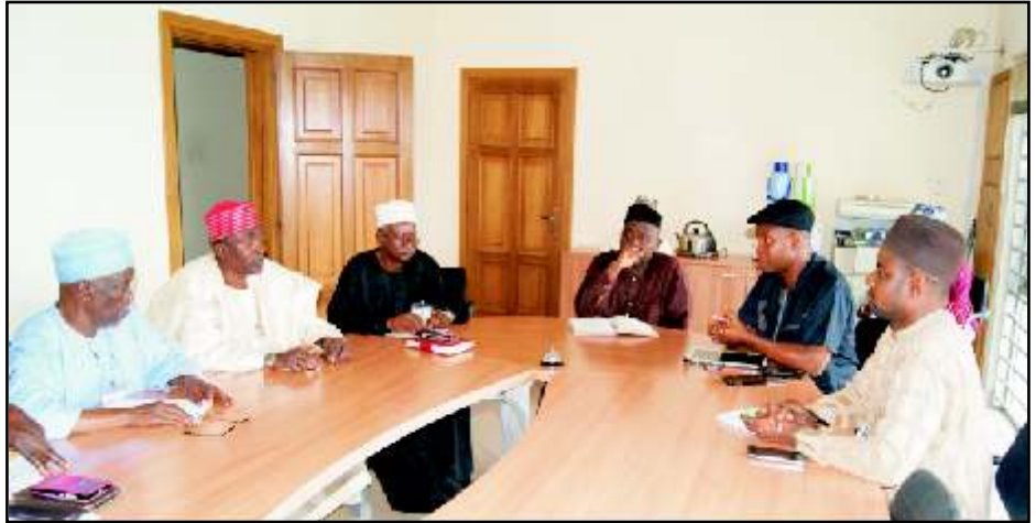
TOPREC delegation (left) with NBTE ES (3rd right) during the visit

He urged the TOPREC to key into the National Vocational