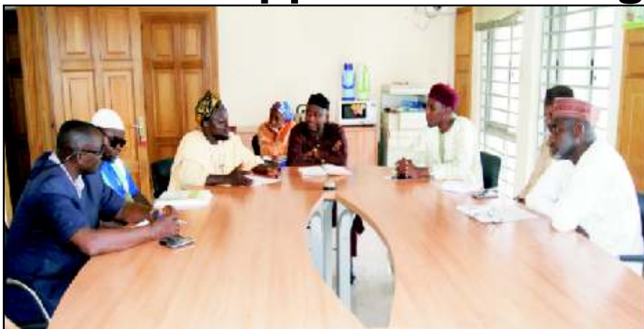
BCSN delegation with ES NBTE (middle) during the meeting

He said the artisans are left behind, and therefore stressed the need for improvement to be able to compete favorably with their counterparts.