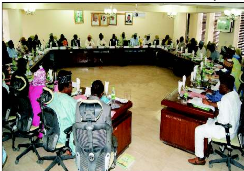
Committee of Chairmen and NBTE Management during the meeting

Other challenges according to the Executive Secretary include the non-implementation of the National Council on Education (NCE) resolution on removal of B.Sc./HND dichotomy, delay in